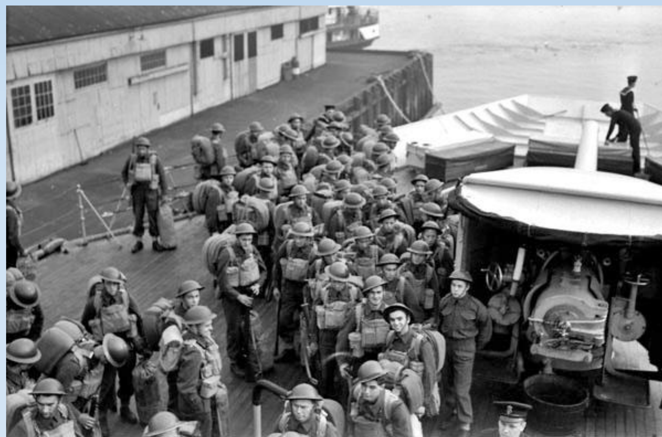
Infantry men of "C" Company, Royal Rifles of Canada boarding HMCS Prince Robert at Vancouver.