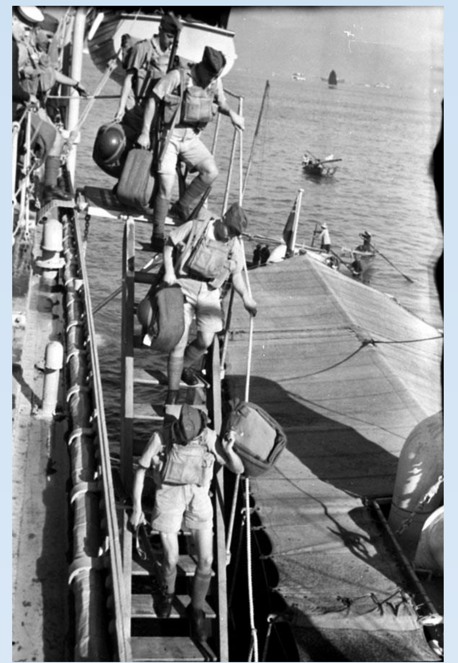
Infantry men of "C" Company, Royal Rifles of Canada disembarking HMCS Prince Robert at Hong Kong. - Canada Dept. of National Defence, Courtesy Library and Archives Canada, PA-037419