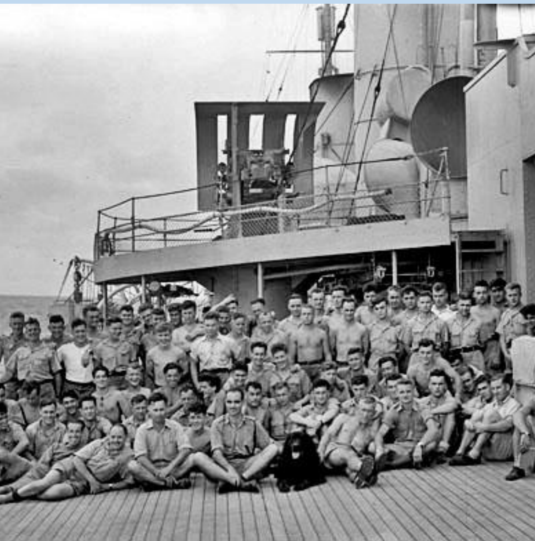
Members of the Royal Rifles of Canada with their mascot "Gander" aboard the Prince Robert at sea.

On the early morning of November 14, 1941 the two ships arrived at Manila to pick up supplies and drop off the mail. At 16:00 hours on the 14th the two ships left Manila and arrived at Hong Kong on November 16.