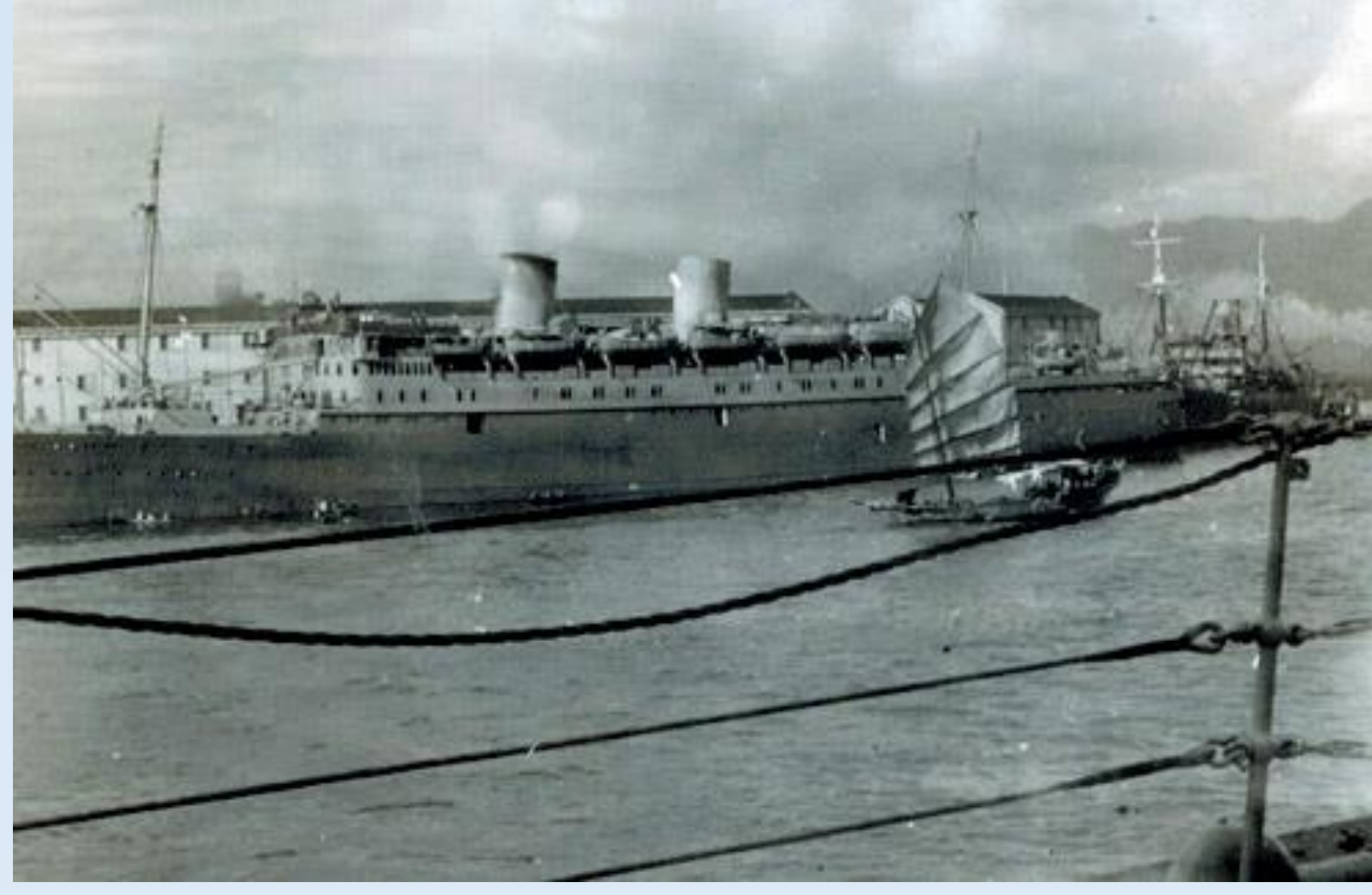
Photo of the Awatea at Hong Kong.

After the arrival of "C" Force at Hong Kong, the newspapers were allowed to print the stories of the troops arriving at Hong Kong.