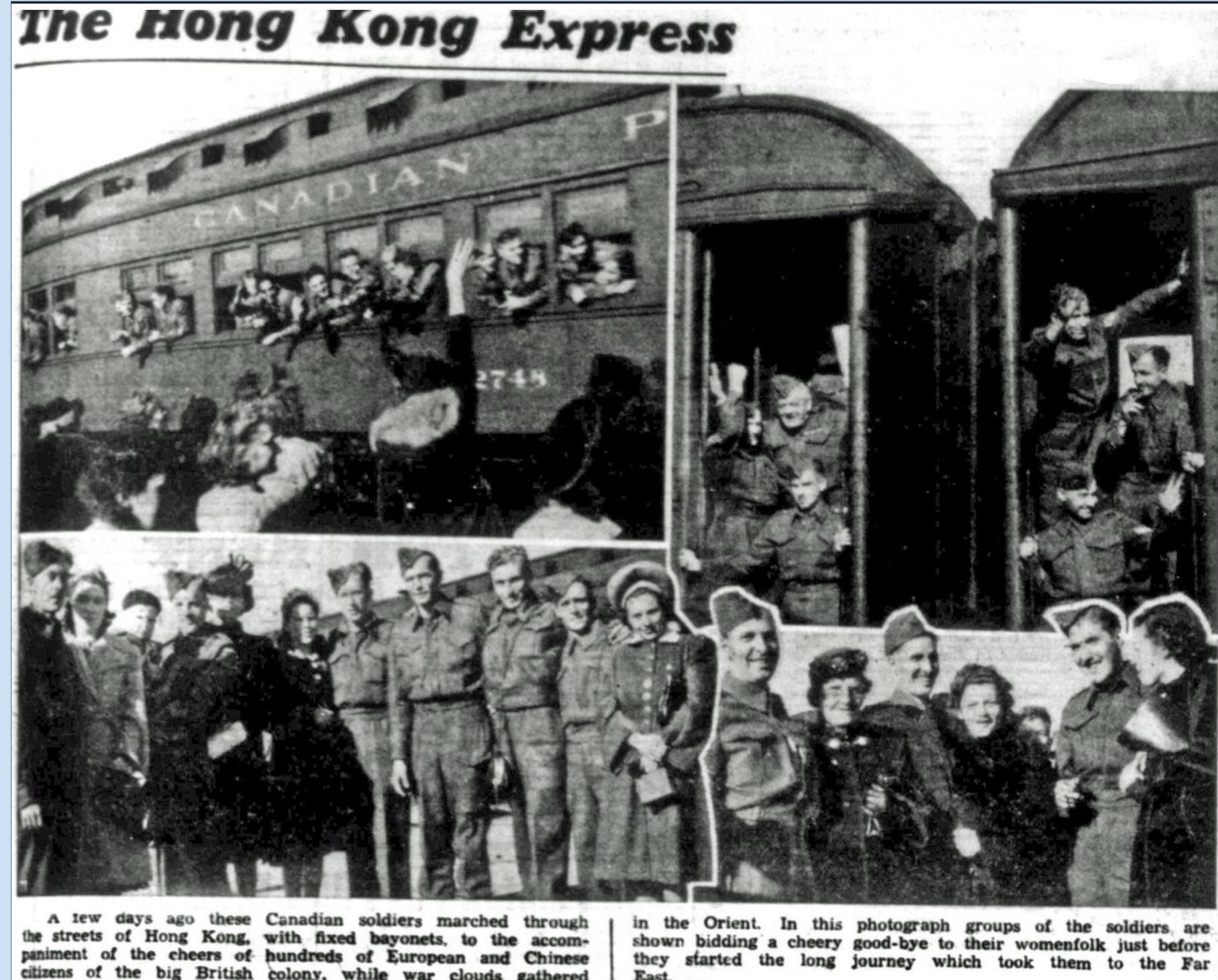
Newspapers were not allowed to publish any details or photos of the troops leaving Winnipeg, upon their arrival at Hong Kong they were then given permission to show photos of the entraining. - Winnipeg Tribune - November 17, 1945

The Winnipeg Grenadiers left Winnipeg on October 25 and also reached Vancouver on October 27.