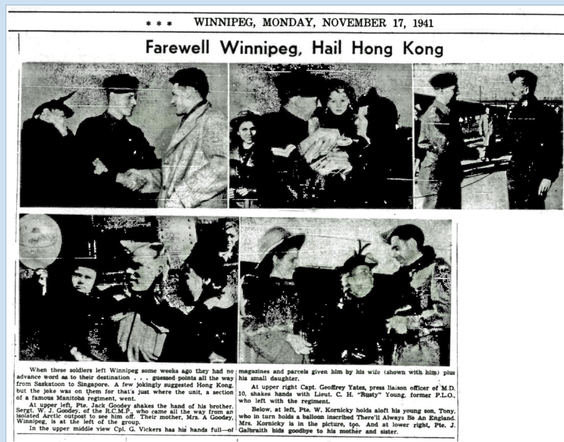
Grenadiers saying good bye to their families. - Winnipeg Tribune - November 17, 1945