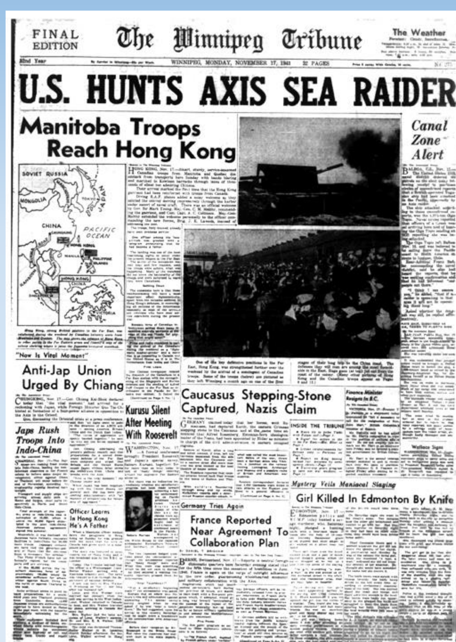
Front page of the November 17, issue of the Winnipeg Tribune which also tells the story of the Grenadiers at Hong Kong. - Winnipeg Tribune, November 17, 1941