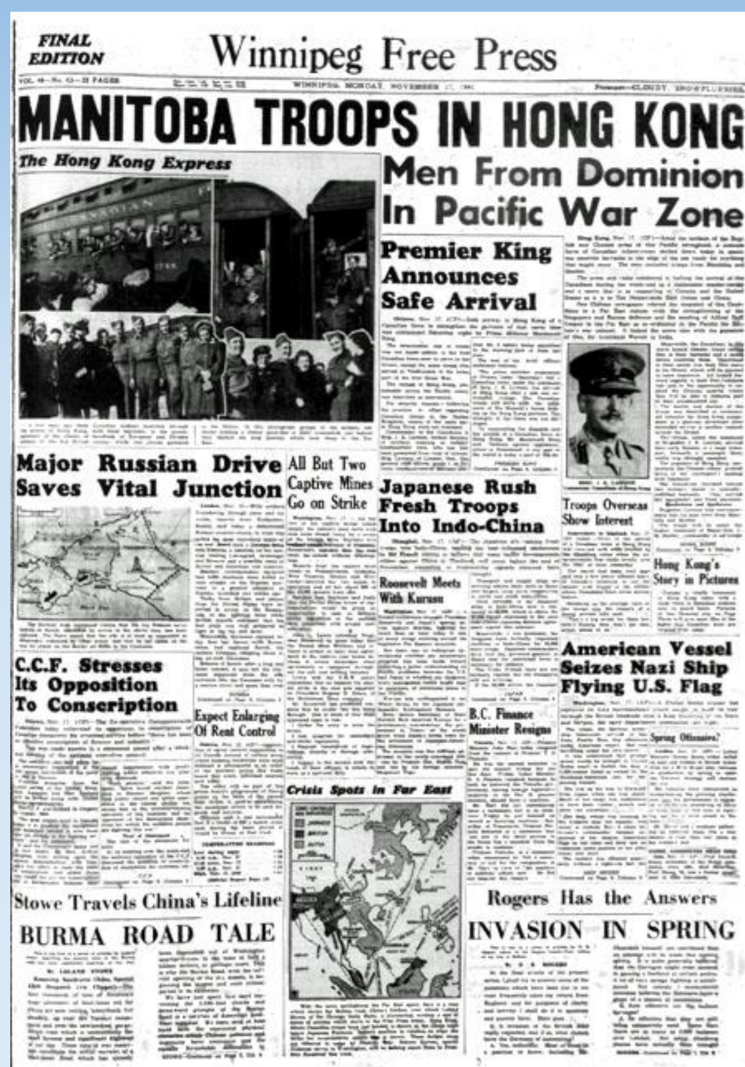
Front page of the November 17, issue of the Winnipeg Free Press which tells the story of the Grenadiers in Hong Kong. - Winnipeg Free Press, November 17, 1941

After the arrival of "C" Force at Hong Kong, the newspapers were allowed to print the stories of the troops arriving at Hong Kong.