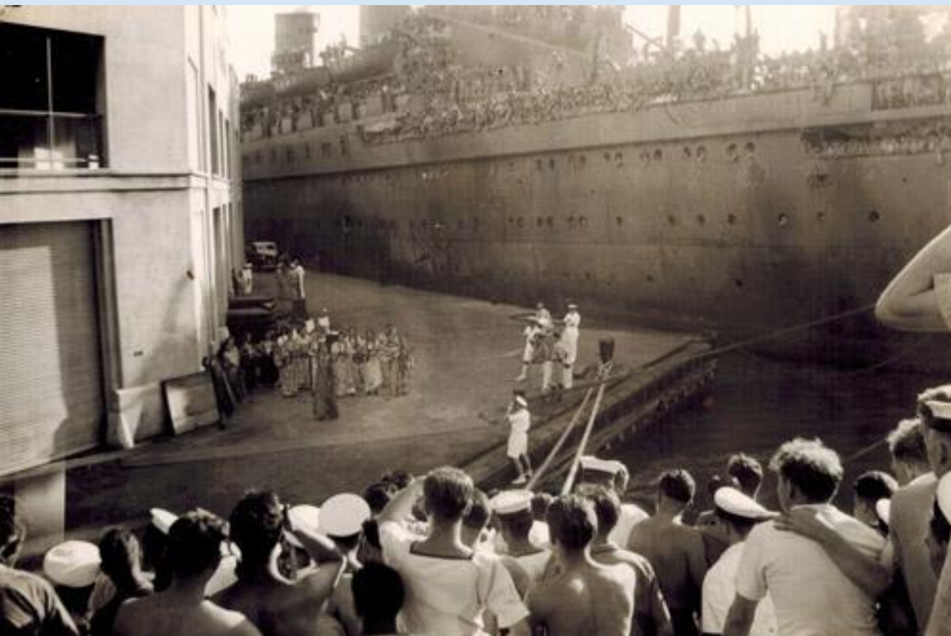
A Hawaiian concert on the pier for the soldiers on HMT Awatea (in background) and the crew of HMCS Prince Robert (in foreground).